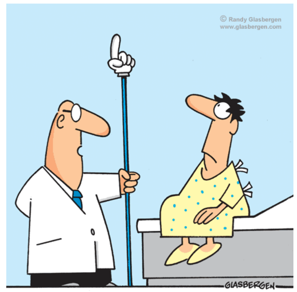
"Frankly, I don't enjoy prostate exams any more than you do!"